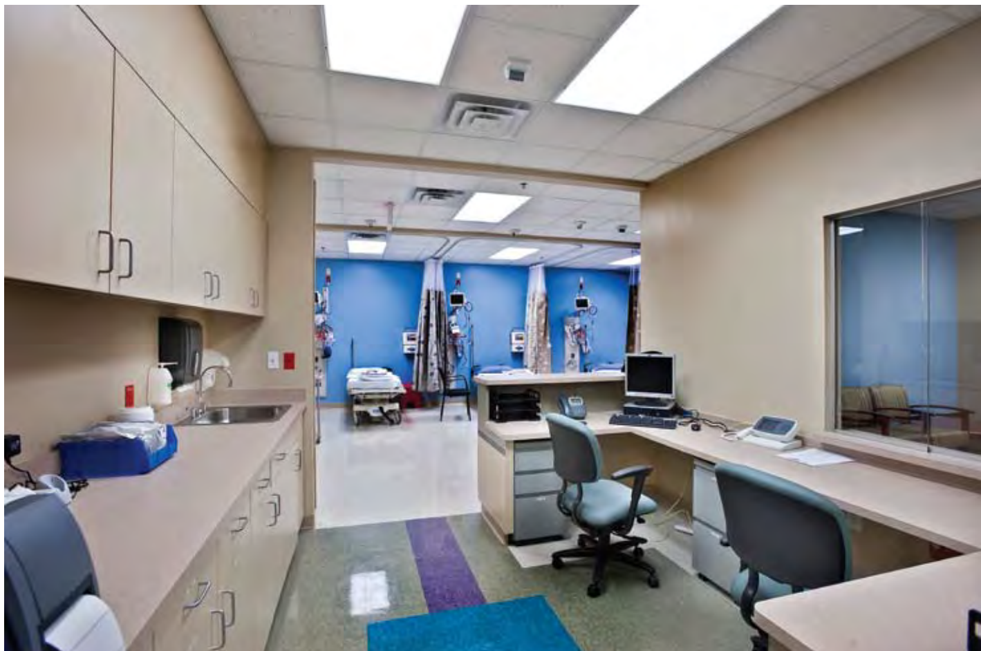
Post Acute Care Unit

Short timeline, complex protocols challenge all | By Margie Church