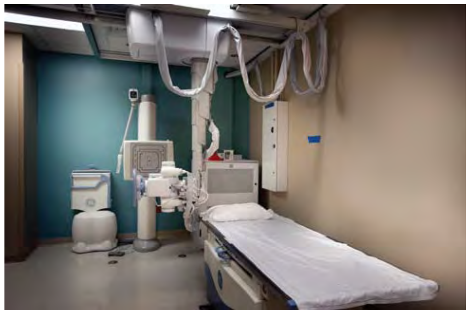
Radiation Exam Room

comprised the first floor. The second and third floor added 82-beds to the hospital's original 58-bed capacity. The fourth floor remains available for future expansion. The hospital opened in 2003, so making the tower facade seamless was straightforward.