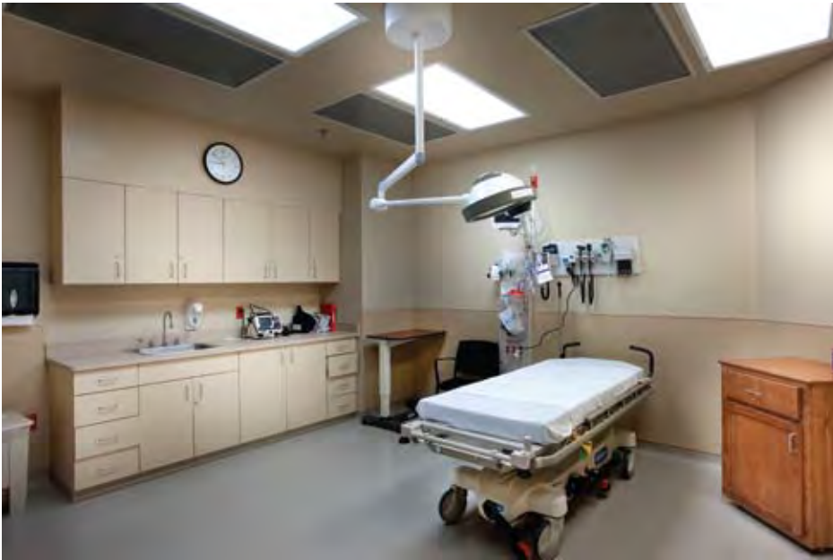
Emergency Department Triage Trauma Room

monumental amounts of coordination,” Bultman said. “The medical gas systems, nurse call systems, life support systems—everything inherent in a hospital had to come together in the walls. I gained new respect for the attention to detail required by projects of this nature.”