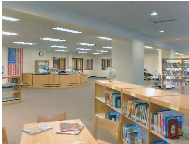
The new library at Belle Chasse Academy fosters a learning environment that focuses on academic excellence.

In fact, there are so many positive features in the school that Fitzgerald cites only some highlights. "The gymnasium is beautiful and multifunctional," she says. "The aesthetics of the curved, windowed wall in the library make that room relaxing and conducive to learning."