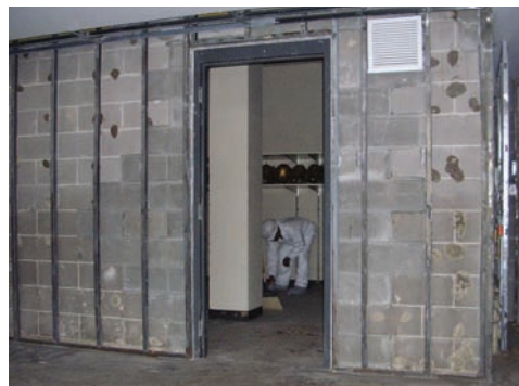
Restoration took place in phases with hundreds of workers and contractors involved in the major construction efforts.

The estimated cleanup cost was around $1 million. The school's restoration work is estimated at approximately $3 million. Restoration construction began in phases, and as each phase continued, hundreds of