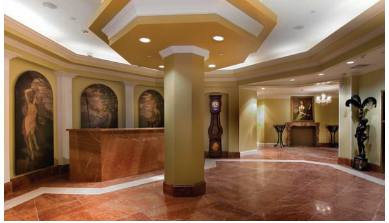
McDonnel completed all of the interior room and back of house area work, reworking existing pieces to preserve the historical setting of the hotel.

Construction took place in every room and ranged from finishes to replacing the wooden doors because they were warped from the water. "We did all of the interior work and reworked existing pieces to be careful and keep the historical setting of the hotel," McDonnel says. The Omni Crescent is expected to reopen in Summer 2007.