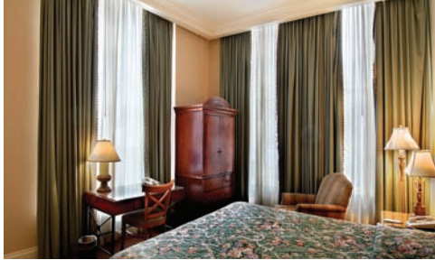
Construction took place in every room, some of which had to be completely gutted to clear out debris and mold.