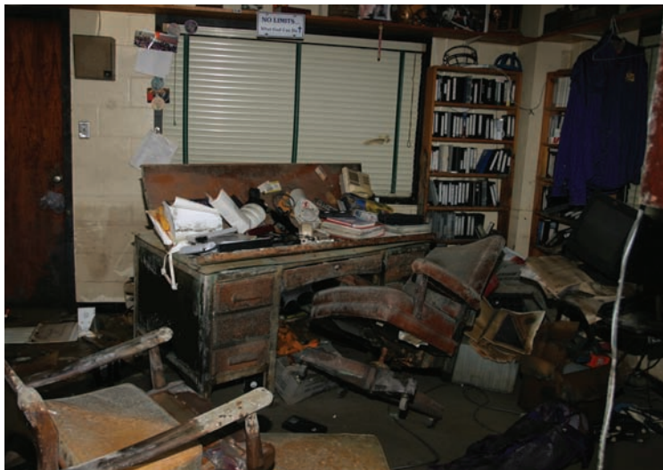
With a $1 million cleanup cost, restoration of St. Augustine High School included removing damaged sheet rock, mold, and wet flooring.

With only 241 same-sex schools in the nation, New Orleans' St. Augustine High School is unique. Established in 1951 as a Roman Catholic school, it has served to foster the growth and education of approximately